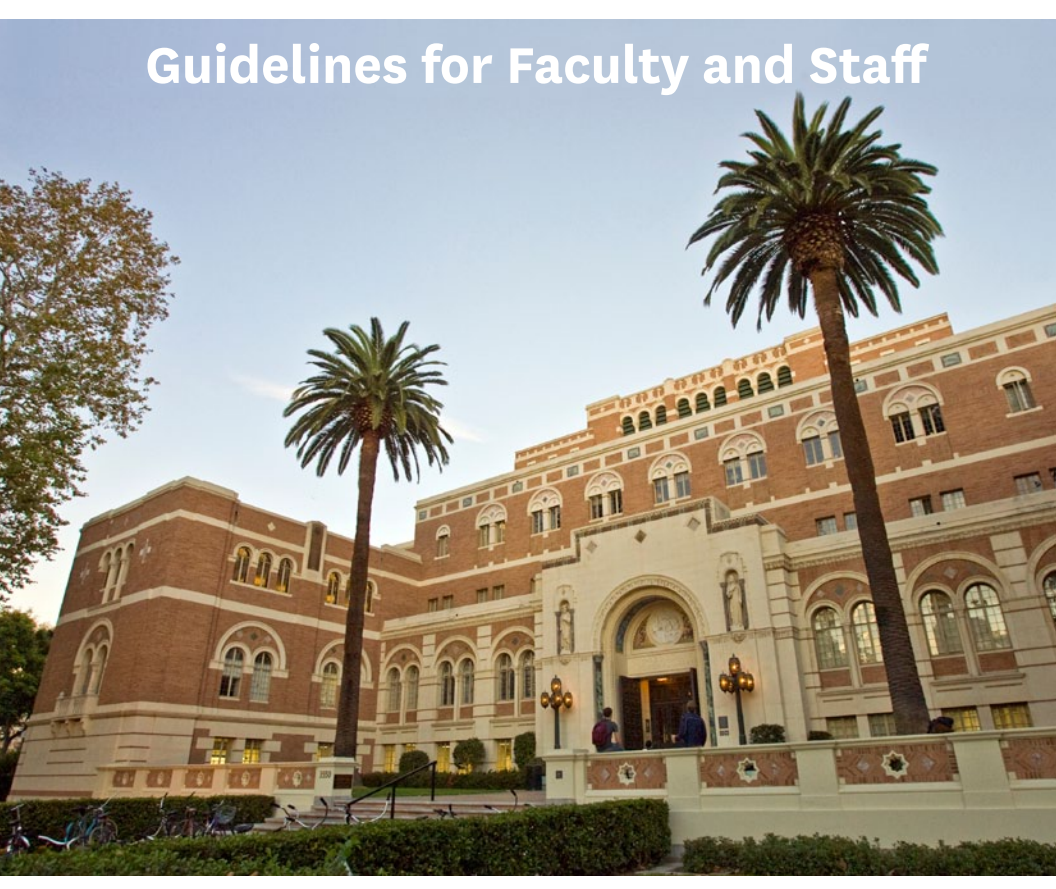
University of Southern California