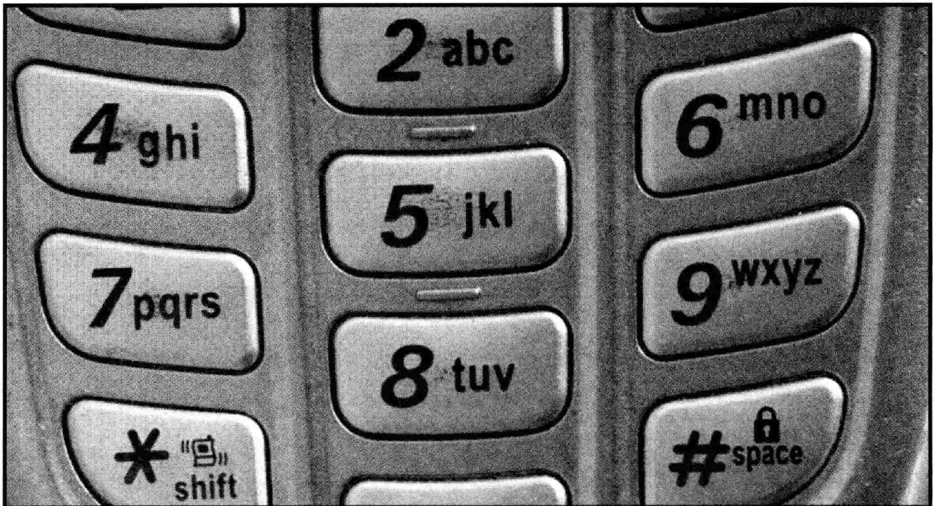
The magical keypad: mobile phones have brought about the diffusion and deepening of the global network society