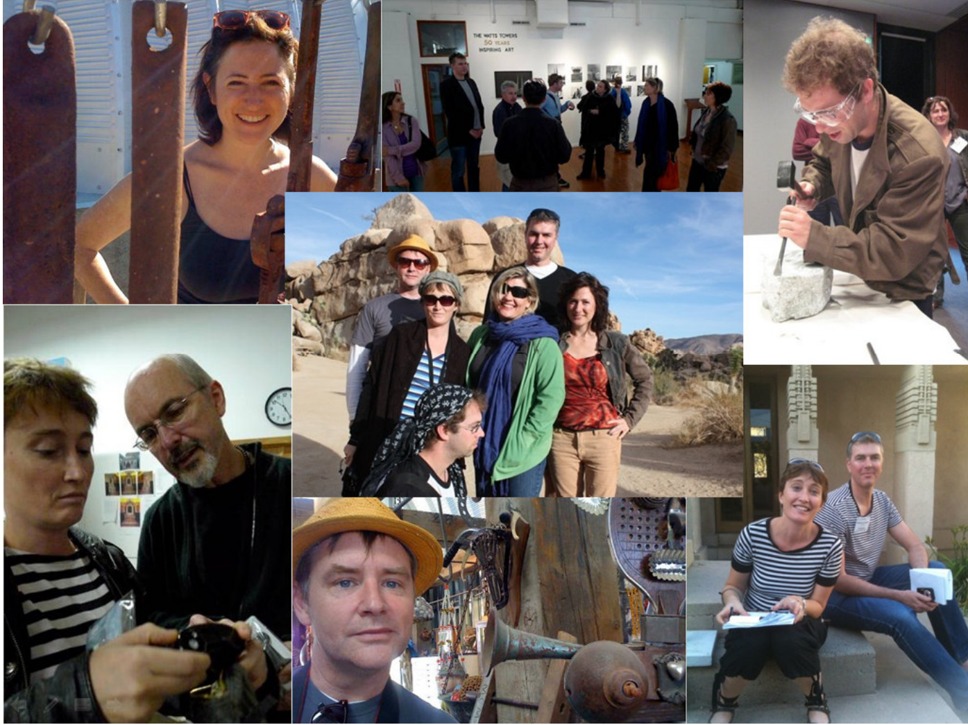
Fellows and experts on the 2010 USC Annenberg/Getty Arts Journalism Fellowship.