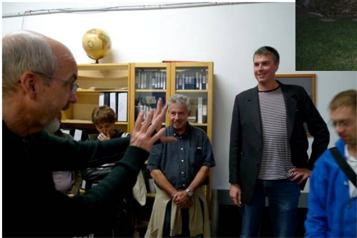
Fellows with groundbreaking video artist Bill Viola (left) at his Long Beach studio.