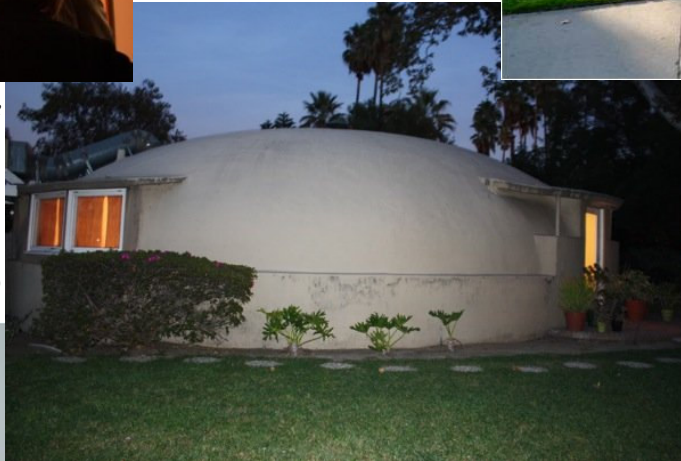
Exterior shot of Neff's Bubble House (right)