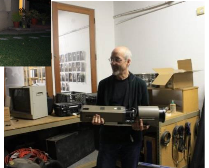
Bill Viola (above)